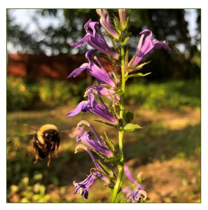
My favorite part is adding natives back into the landscape. In the areas where I feel invasives are under control I have planted native shrubs such as elderberry, witch hazel, and spicebush. Native

In addition to chemical management, I have spent a lot of time hand pulling the new sprouts of invasive plants. It has been two years and it will take more years to manage these species, but I can say we have gone down from 0.5 acres of Japanese knotweed to 0.2 acres and the other species are under control. Care for a natural area will always involve monitoring, even after the invasive species are gone. The seedbank contains more invasive species to manage, but hopefully natives as well will now have the space to thrive. There is a peace in working hard to restore an area for wildlife and to see changes happen. The second year, much more bloodroot popped up naturally out of the seedbank!