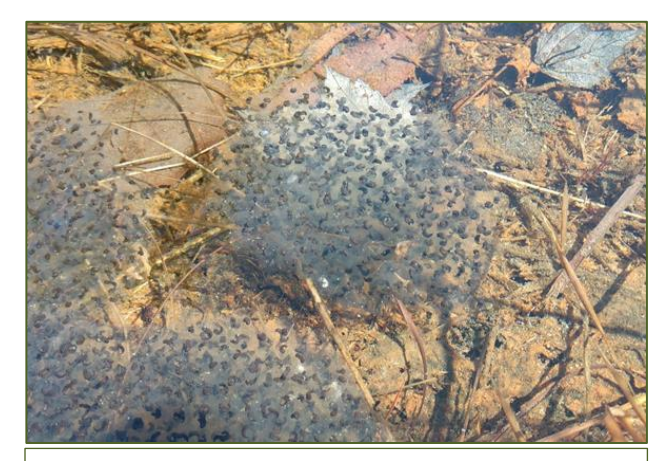
Wood frog egg masses in restored wetlands.

the dewatered parts of the wetland but were replaced by higher quality wetland plants within a couple of seasons. Aquatic life also rebounded quite rapidly with wood frog eggs observed in the third season.