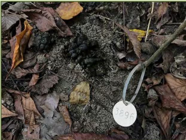
Deer pellets next to one of my planted tree seedlings in one of my removal plots.

Frequency of browse damage was greater for seedlings in the Removal plots than the other 3 treatments. I also found reduced survival of white oaks and sugar maples in Removal plots. Because white oaks and sugar maples are preferred browse for deer, the increased browse intensity, paired with reduced survival, suggests increased browse-related mortality of palatable species where honeysuckle shrubs are completely removed from the understory. I will continue collecting data through June of this year and will reach more definitive conclusions once the data have been analyzed.