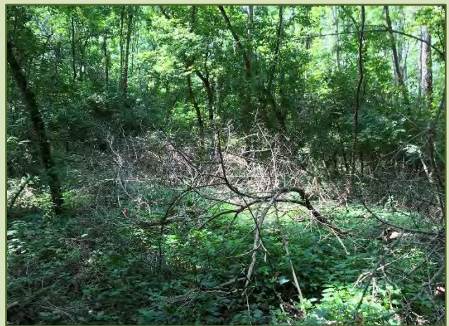
An example of the structure provided by the dead honeysuckle branches in one of my Felling plots. Seedlings are planted within the fallen branches.

In order to investigate these questions, I established 32, 6m radius experimental plots in the Miami University Natural Areas and I assigned the plots to 4 treatments: Control, Felling (honeysuckle shrubs cut and branches left where they fell), Removal (honeysuckle shrubs and branches removed from the plots), and Standing (shrubs killed with a basal bark herbicide of Garlon 4 Ultra herbicide mixed with Arborchem oil). With funding assistance from an OIPC grant, I then planted 16 native tree seedlings in each plot, 4 each of sugar maple, white oak, common hackberry, and American hornbeam. I then measured survival, height, leaf number, and browse for each seedling monthly from June through October of 2017.