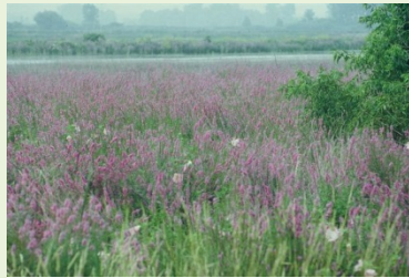
Purple loosestrife in Lake Erie marshes

OIPC began working on an invasive plant protocol in 2008 in an effort to revise the existing